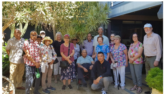
Members at La Spota Lane Garden and at Last Local for lunch