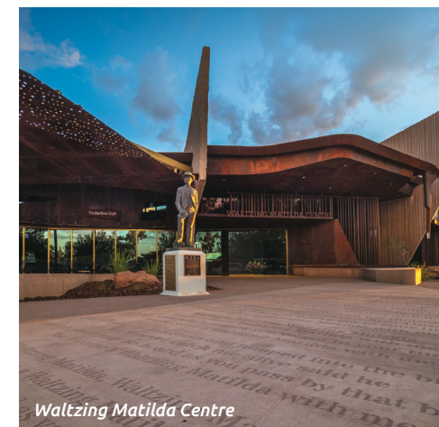
Waltzing Matilda Centre