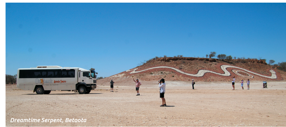
Dreamtime Serpent, Betoota