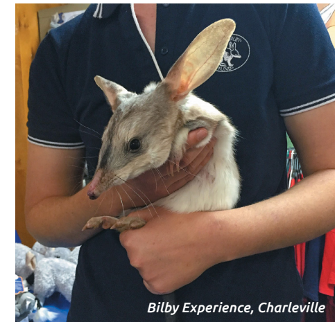
Bilby Experience, Charleville