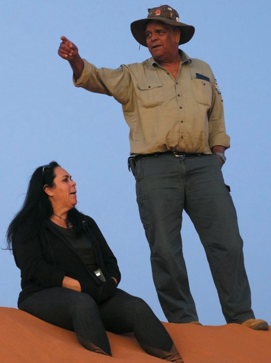
Big Red Sand Dune, Birdsville

OUR POPULAR FULLY INCLUSIVE TOUR FEATURING BIRDSVILLE, WHERE THE CHANNEL COUNTRY MEETS THE DESERT