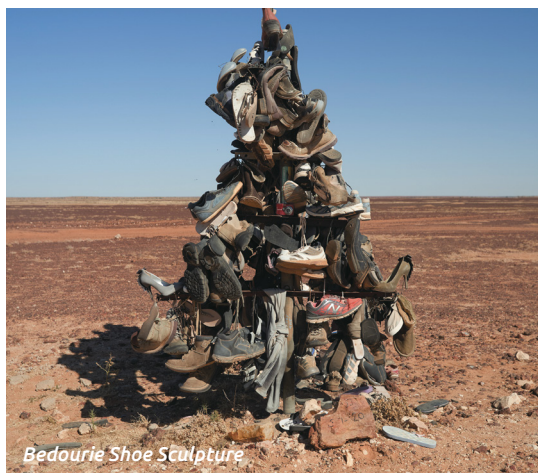
Bedourie Shoe Sculpture

Overnight Australian Hotel or Desert Sands Motel, Boulia (B L D)