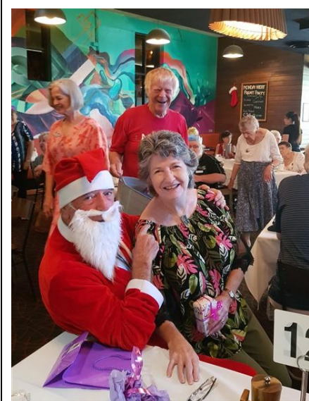
Santa cuddling the ladies...